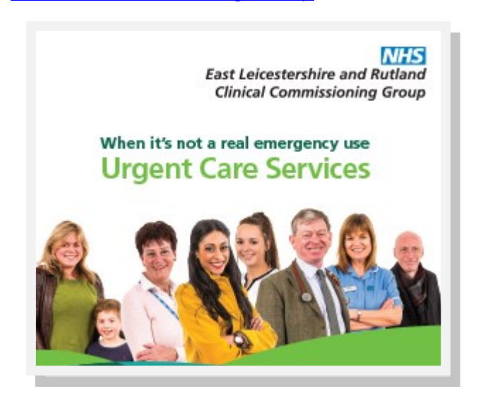
Rutland's Urgent Care Service is based at the Memorial Hospital in Oakham

You can find out more about the new urgent care service on the Council's website or through <u>East Leicestershire and Rutland</u> Clinical Commissioning Group.